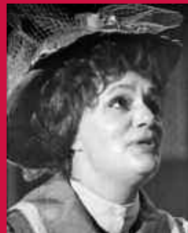
Hello Dolly 1986